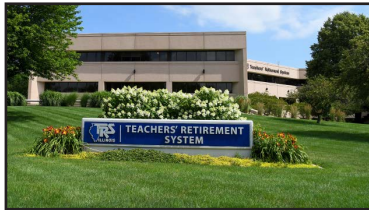
TRS Springfield office - present