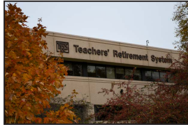
TRS Springfield office - present

dedicated “subject shortage areas” without the annuitant forfeiting their benefit for exceeding post-retirement work limitations.