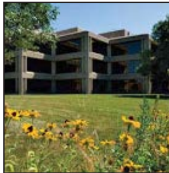
TRS Lisle office - present

In order for a TRS member to take advantage of the Early Retirement Option, all of the member’s employers during his or her last year of employment must approve the member’s use of ERO and certify eligibility for the program. If all final-year employers do not approve and certify the