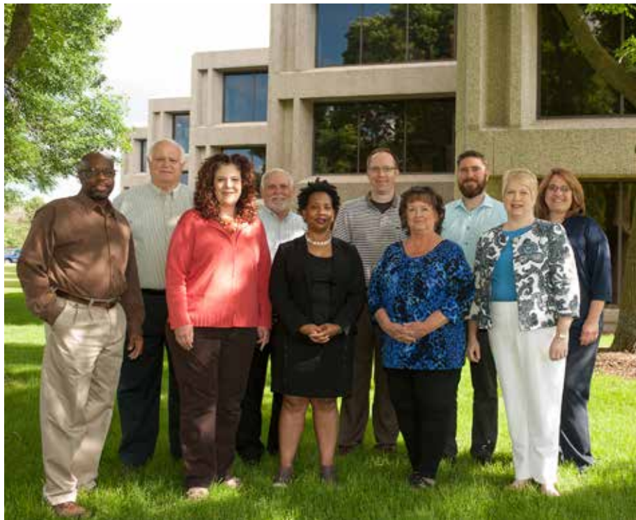
TRS staff located in Lisle, June 2016