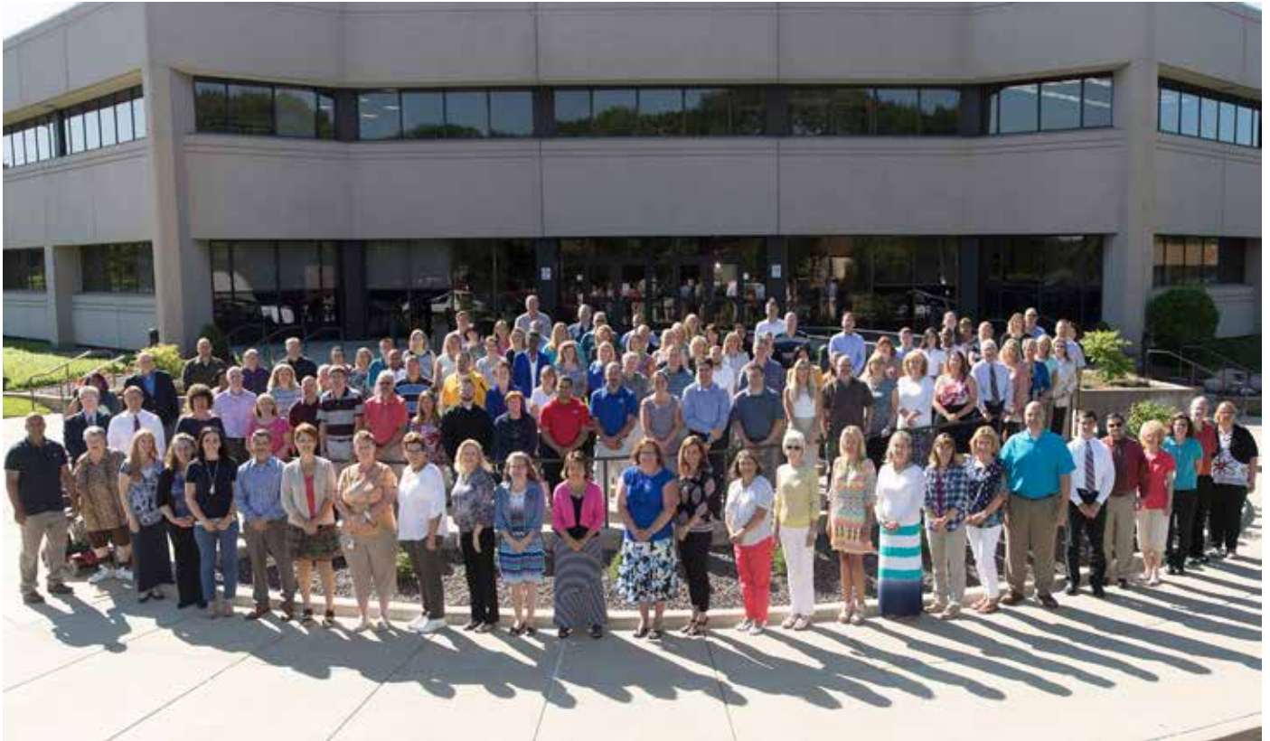
TRS staff located in Springfield, June 2016