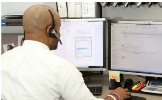
One of our TRS counselors helps a member with a retirement estimate by phone.

TRS retains and protects, within the bounds of disclosures required by law, all of your personalized data, which includes teaching service, purchased optional