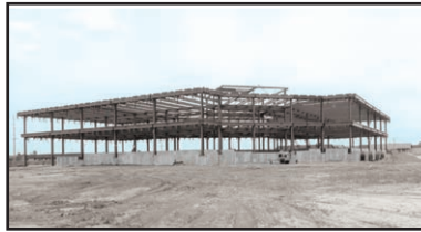
TRS Springfield office - July 1978