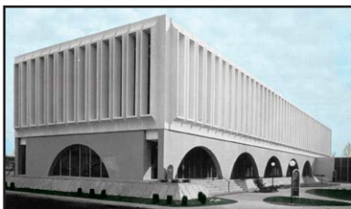
Lles Park Place the TRS office from 1966 - 1979